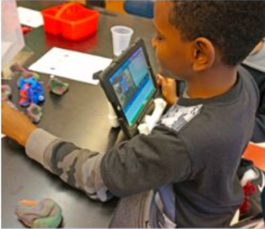
Poetry in Action