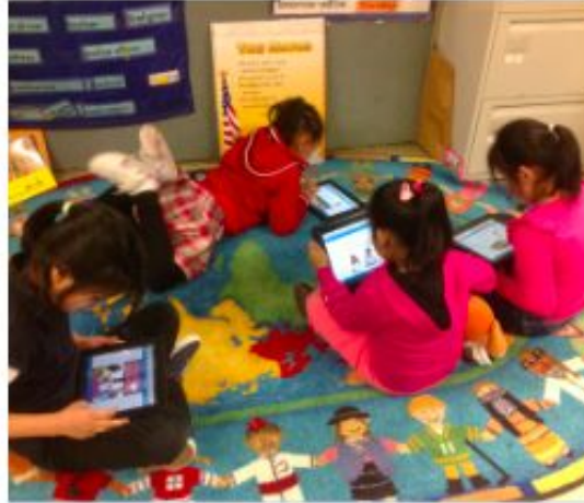
eBooks & eComics